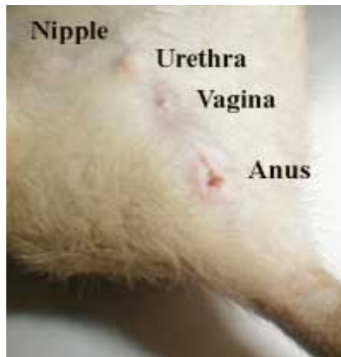
Female - Adult

It is also useful to bear in mind that females can be spayed and male rats can be neutered. Neutering is preferable if you want to keep your rats in mixed sex groups, because this procedure is less invasive than the surgery required for spaying. Always remember to ensure that your chosen veterinary clinic has adequate experience in the procedure and that you follow all pre and post-surgery care set by your veterinarian.