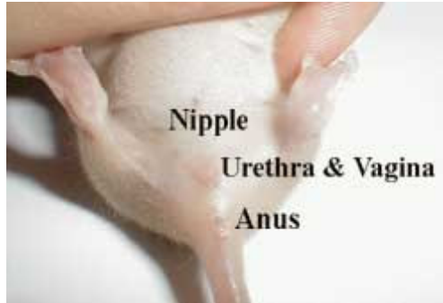
Female - 2 weeks old

For older rats, a male rat will have large testicles and a female rat will have nipples. Be aware that male rats will draw in their testicles when they get scared, so they may be hard to find.