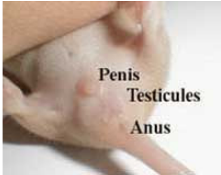
Male - 2 weeks old

Younger rats, as young as a day old can be sexed, females will have small dots where the nipples will be and males will have a small bump where the testicles and penis will be located. It often takes a while for young males to show however so be very careful.