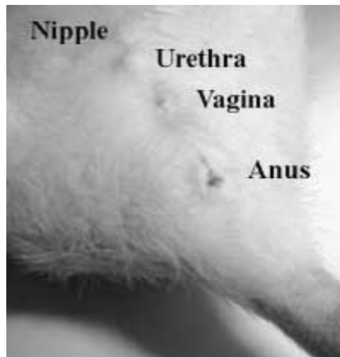
Female - Adult

It is also useful to bear in mind that females can be spayed and male rats can be neutered. Neutering is preferable if you want to keep your rats in mixed sex groups, because this procedure is less invasive than the surgery required for spaying. Always remember to ensure that your chosen veterinary clinic has adequate experience in the procedure and that you follow all pre and post-surgery care set by your veterinarian.