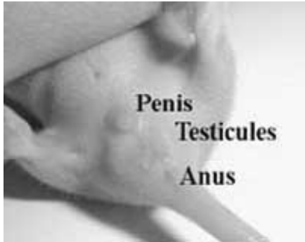
Male - 2 weeks old

Younger rats, as young as a day old can be sexed, females will have small dots where the nipples will be and males will have a small bump where the testicles and penis will be located. It often takes a while for young males to show however so be very careful.